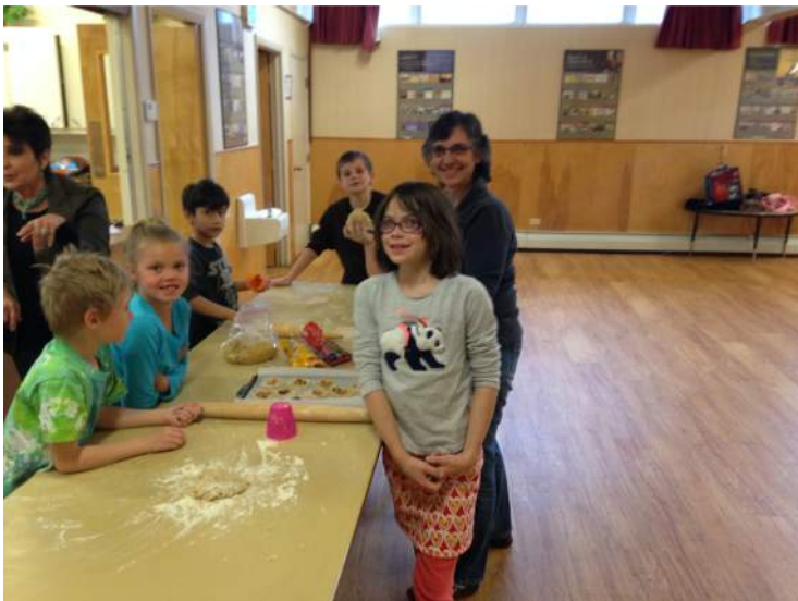
The childrens school making hamantaschen for Purim.